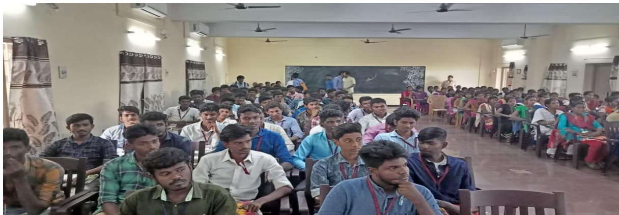
One day training program CADD center, on 04.01.2019

3(ix) Two students of 2016-2019 batch attended Online Interview conducted by TCS “Smart Hiring 2019” at Periyar Maniammai University, Thanjavur on 05.01.2019.