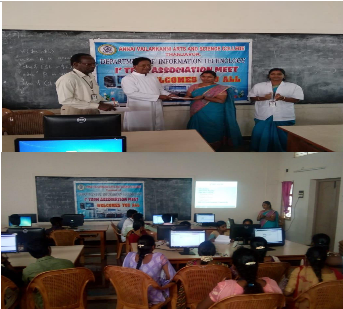
Regional Workshop on ASP.Net organised by IT department on 18.01.2019