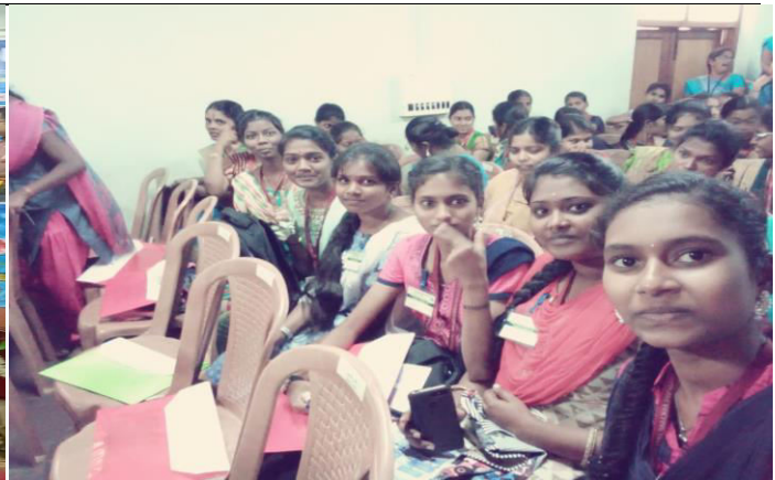
One Day National Seminar “Data Mining with Machine Learning” at Sengamala Thayaar Educational Trust Women’s College, Mannargudi,