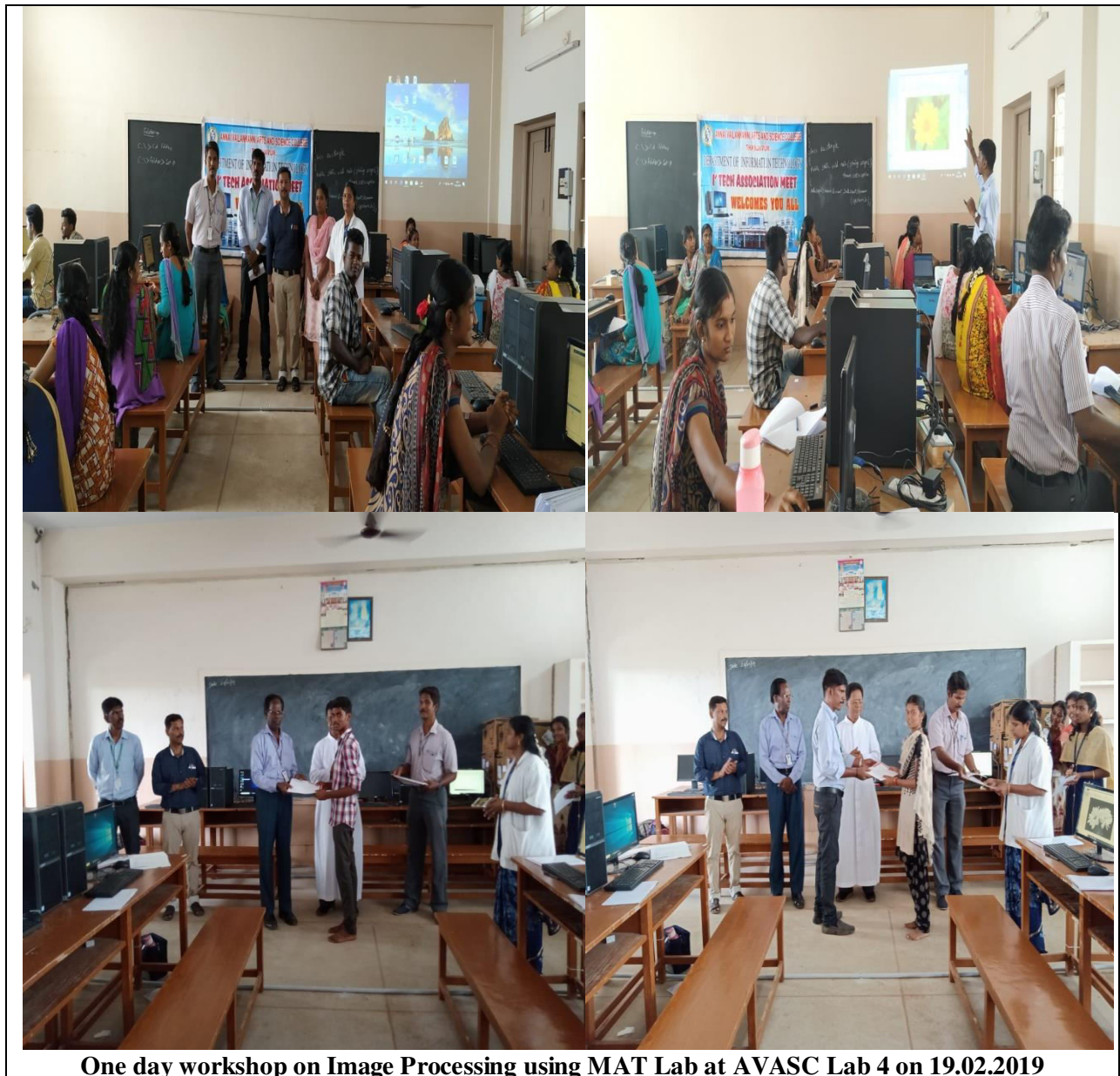
One day workshop on Image Processing using MAT Lab at AVASC Lab 4 on 19.02.2019

One day workshop on “Image Processing using MAT Lab” jointly organized by Department of Information Technology and KALVI Institute, Madurai at Annai Vailankanni Arts and Science College, Thanjavur on 19.02.2019. Final year students 25 from Information technology and 5 students from Computer Science were attended and practiced the MAT lab programs for image processing.