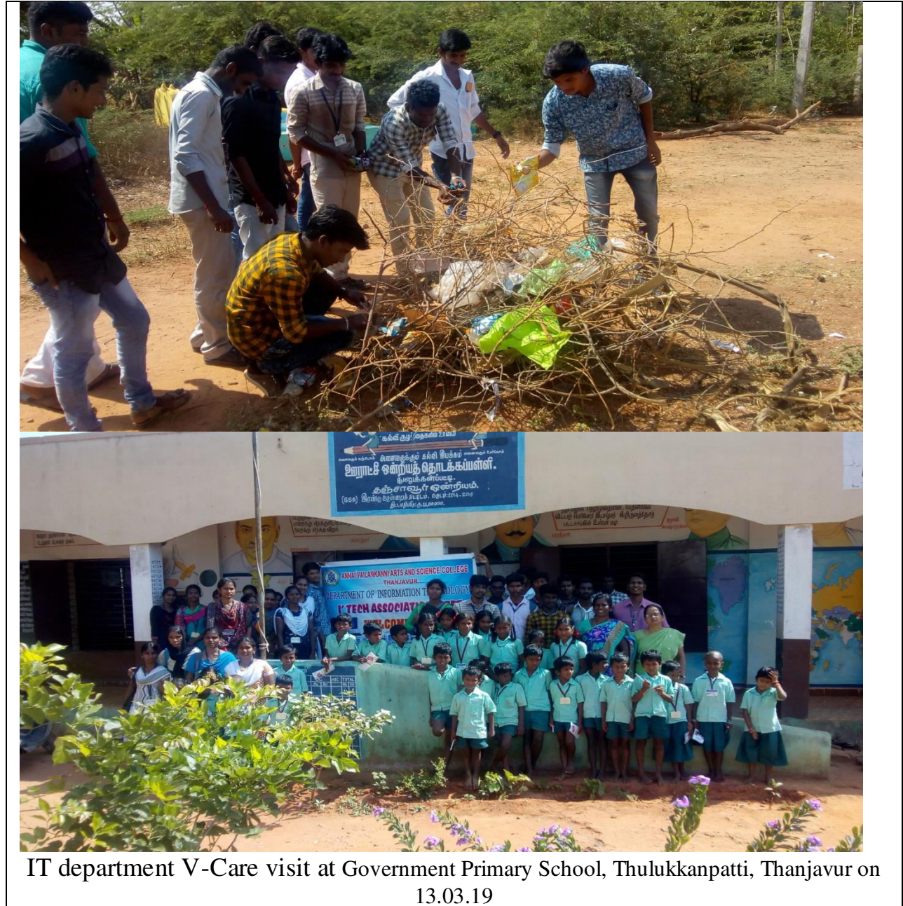
IT department V-Care visit at Government Primary School, Thulukkanpatti, Thanjavur on 13.03.19