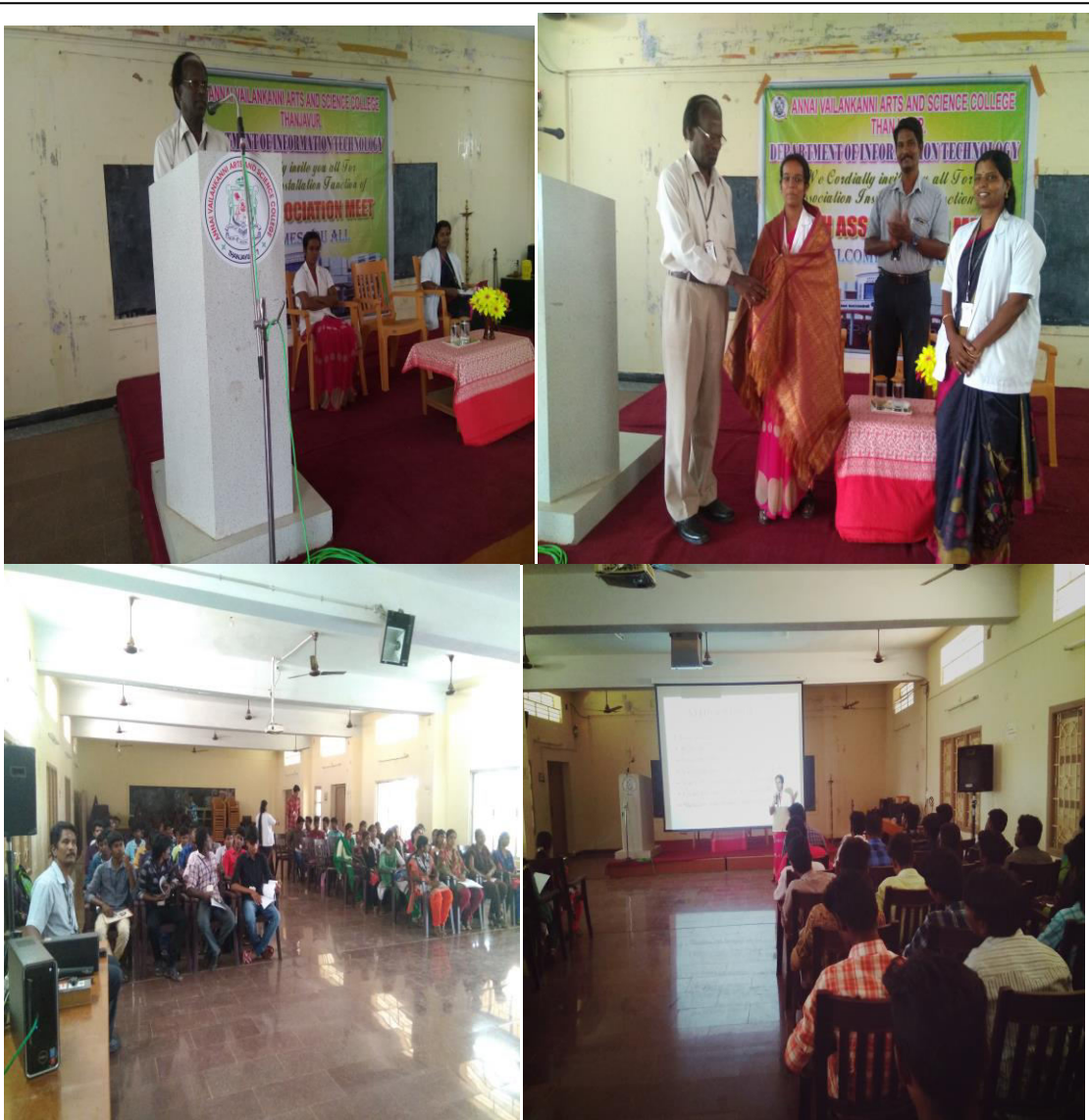
Workshop on Website Creation held on 04.08.2018 at Hall 'B'